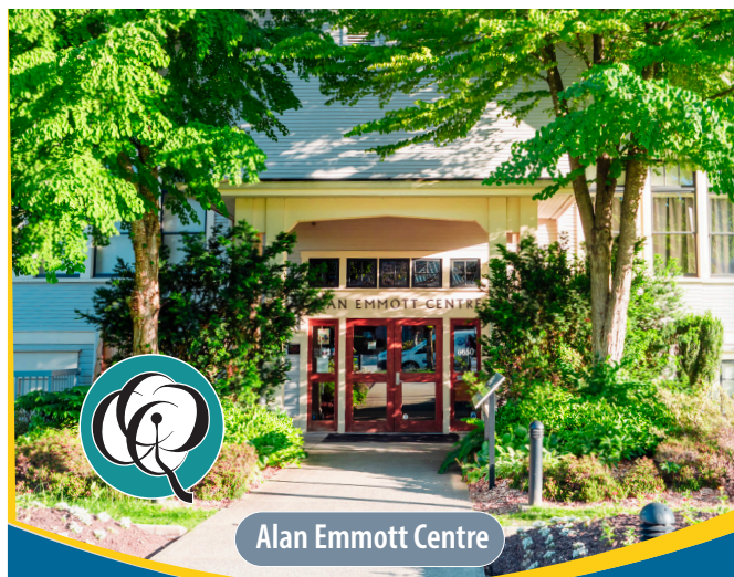
Alan Emmott Centre

Donations welcome. Tax receipt available.